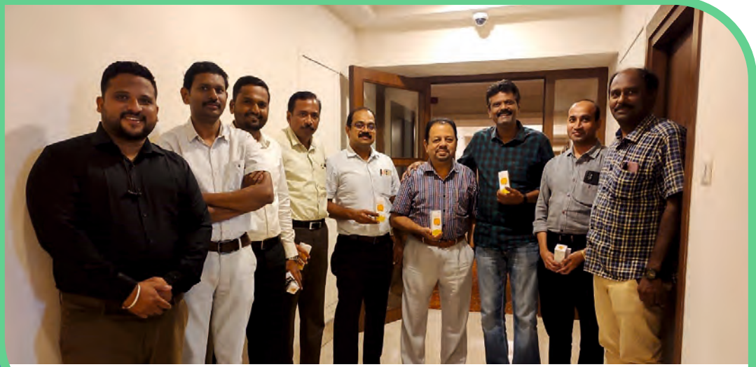
Doctors CME connect at Erode