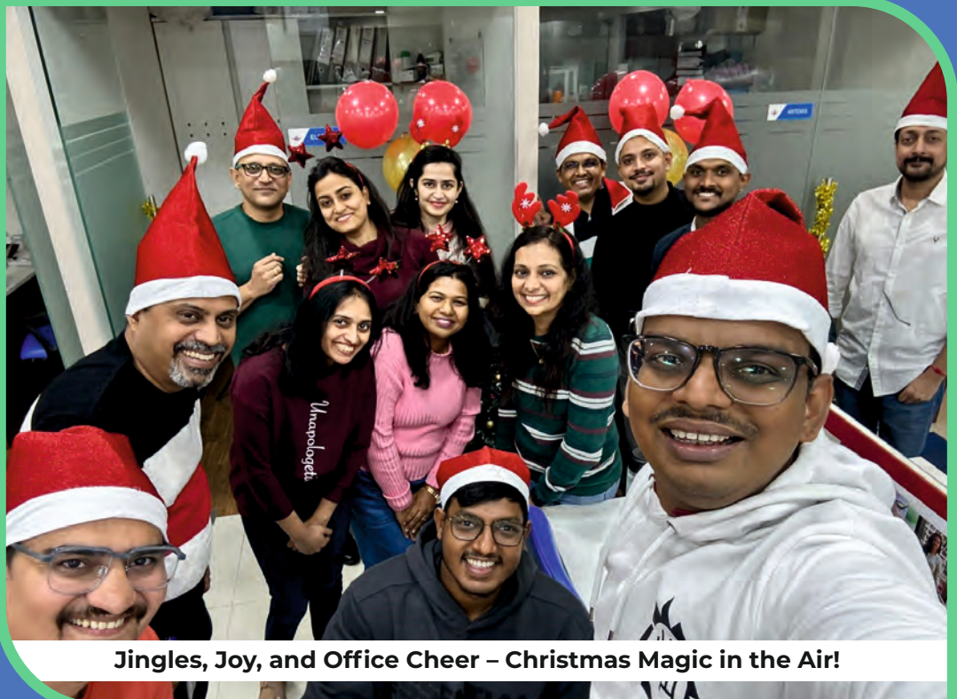
Jingles, Joy, and Office Cheer – Christmas Magic in the Air!