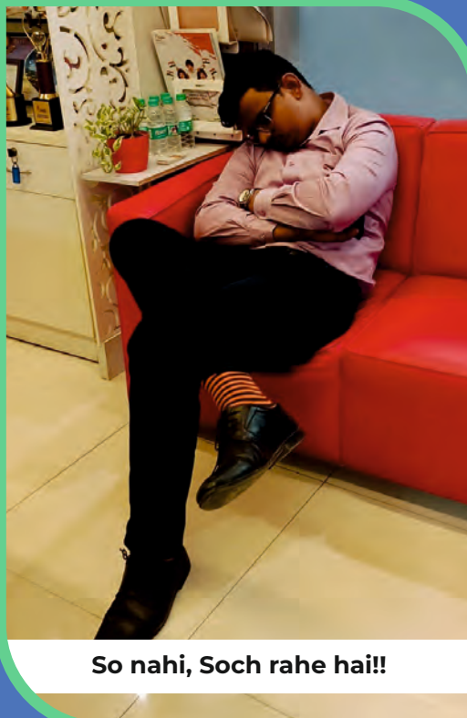
So nahi, Soch rahe hai!!