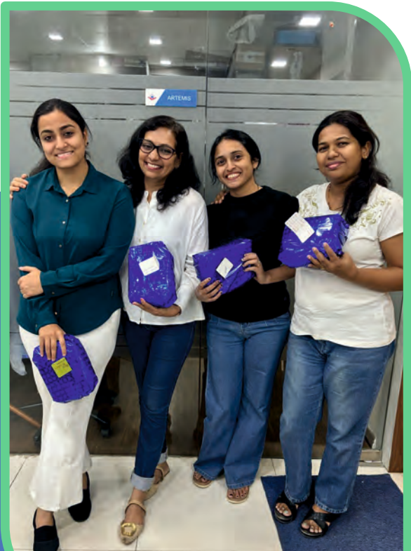
A Special Women's Day at Inzpera!