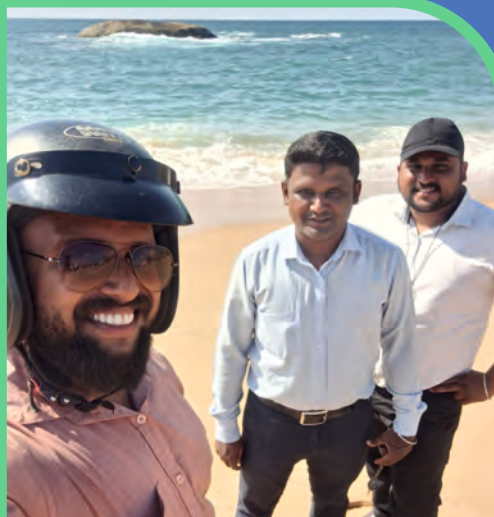
3G's During Field work - Leisure at Nagercoil Beach