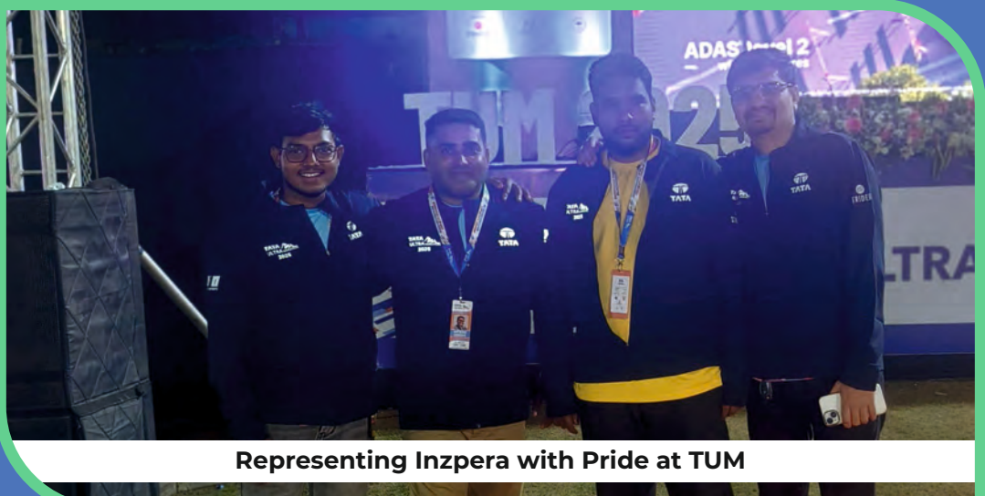
Representing Inzpera with Pride at TUM