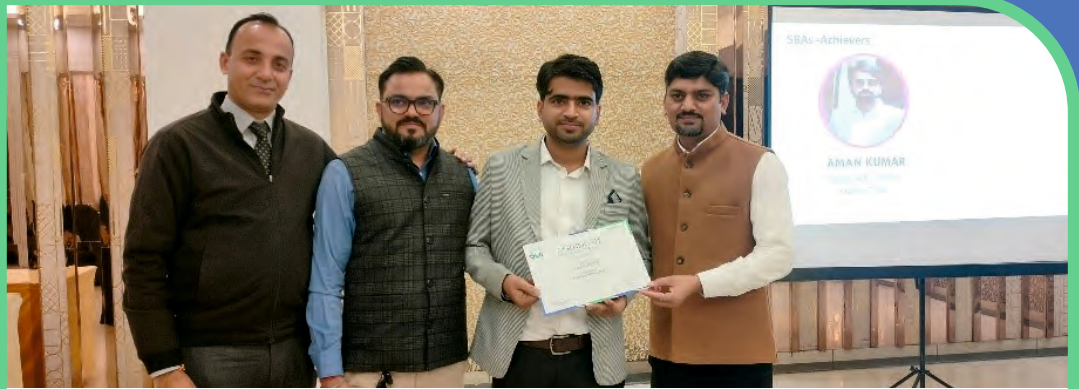
Honouring Excellence: Celebrating Our All-Time Topper's Outstanding Achievement