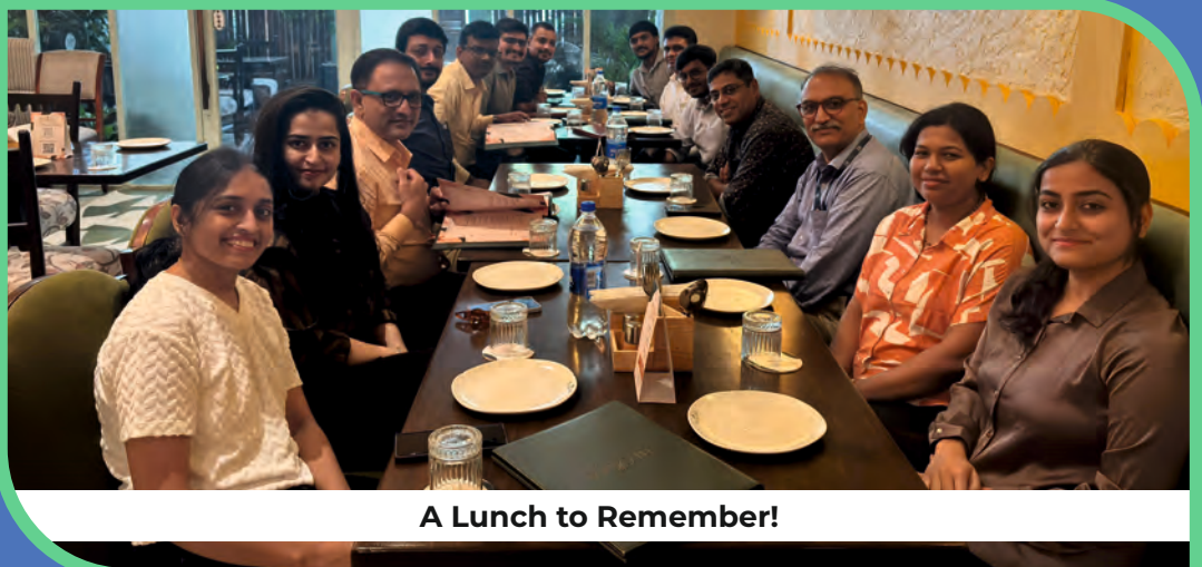
A Lunch to Remember!